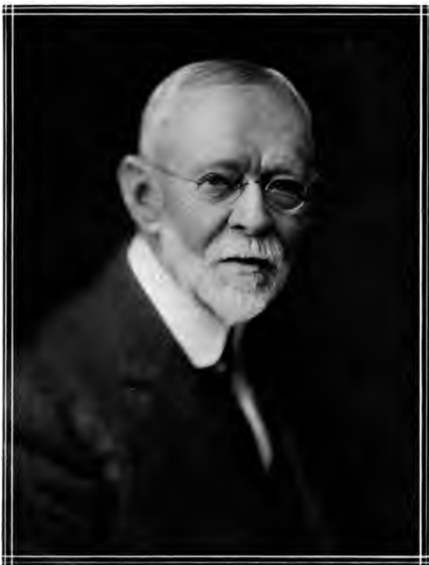
A CAMERA GLANCE AT EIGHTY